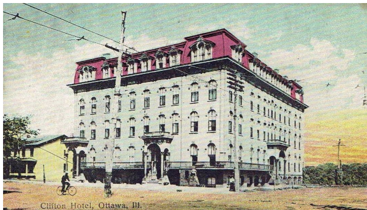
The Clifton Hotel

There were 83 streets in Ottawa, these were dirt, some had board sidewalks. The downtown court house had not been started, yet, so the Clifton Hotel was the largest building in the city, and lodged lawyers and judges for the Fifth District for the State Supreme Court. There was no bridge over the Illinois River, but the Illinois Michigan Canal opened through Ottawa in 1865. Ottawa was the largest city in LaSalle county with 7736 residents in 1870, about 1200 more than in 1860. The increase in population was recognized as a result of people moving to Ottawa because of the building of the I and M Canal, and the two Army Camps that had been located west of Ottawa.